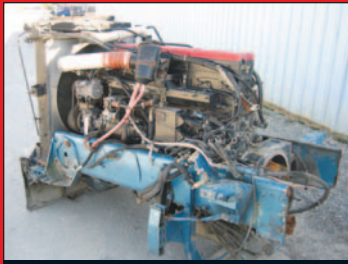
Cummins N14 Red Top Frame Cut