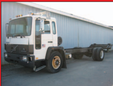
1992 Volvo FE7 Single Axle Truck Cat Power Long Wheel Base