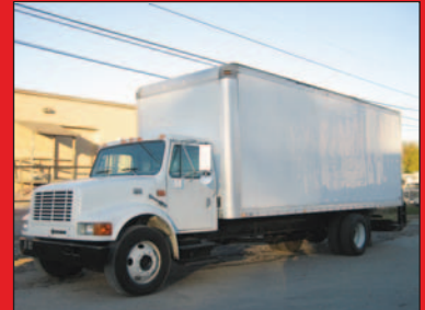
1998 International 4700 Box Van Truck