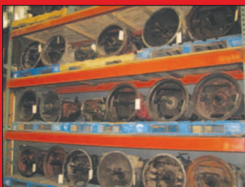
250+ REBUILT, USED & Core Transmissions