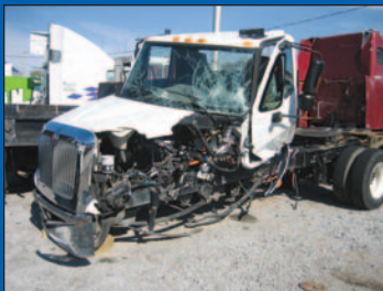
2006 International 8600 Cummins ISM 330hp - Clean Title