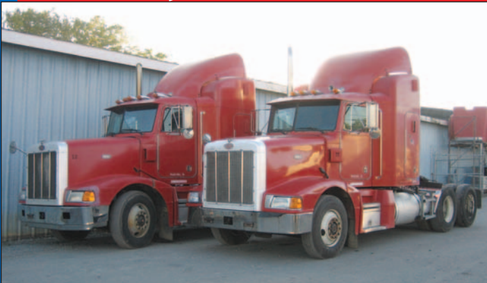
1995 Peterbilt 377 Detroit 12.7, 10 speed Eaton Rears (2 of 3)

OVER 1,200 ITEMS!!! COME EARLY AND STAY LATE!!!