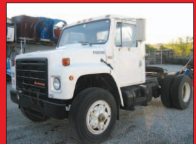
International S1900 Single Axle Truck DT466