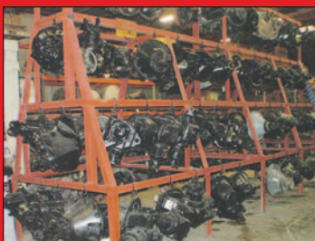
100+ NEW, REBUILT & USED Differentials