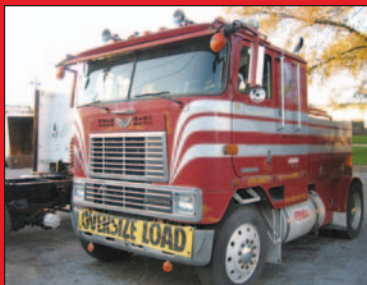
International Eagle Mobile Home Mover NO MOTOR or Transmission