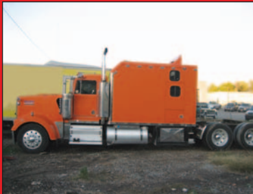
1992 Kenworth W900 Engine Fire needs motor - Clean Title