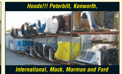
Hoods!!! Peterbilt, Kenworth,