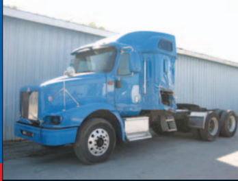
2002 International 9200 ISM Cummins RUNNING Easy Fixer - Clean Title