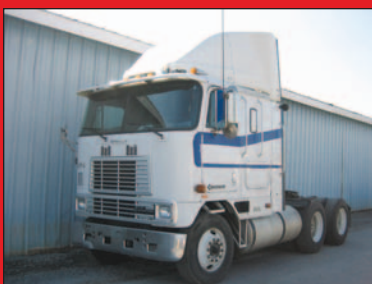
1995 International 9670 Tandem Axle Detroit Series 60