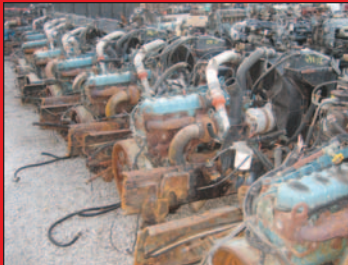
Several International DT360 & DT466