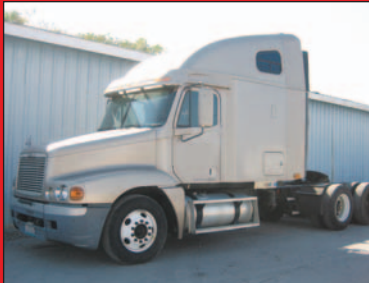
1997 Freightliner Century Classic Cummins N14+