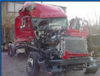
2006 Freightliner Columbia 14L Detroit with Broken Turbo - Clean Title