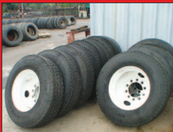
Hundreds of Used Tires and Wheels