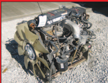
Cummins 5.9L 325hp (Transmission to sell separate) - ONLY 20,000 miles