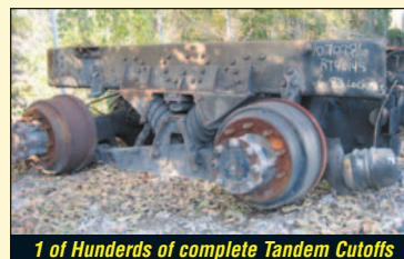
1 of Hundreds of complete Tandem Cutoffs