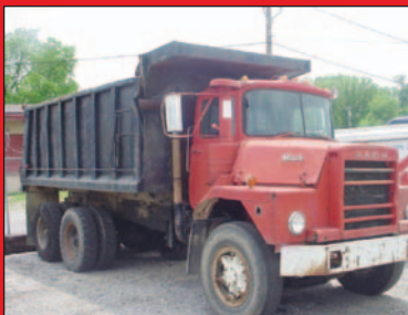
Mack DM 685 Tandem Axle Dump Truck