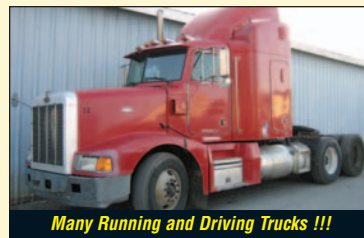
Many Running and Driving Trucks !!!