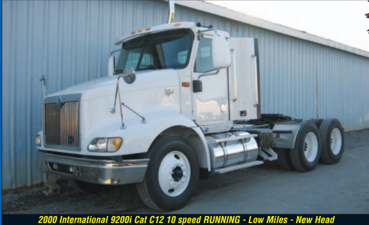
2000 International 9200i Cat C12 10 speed RUNNING - Low Miles - New Head