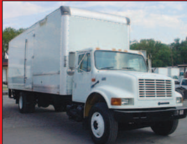
2000 International 4900 DT466E Box Van Truck 102" Wide