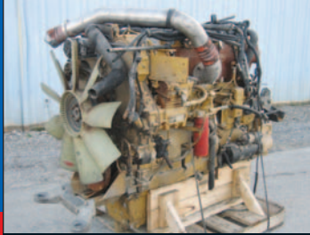
Caterpillar C15 475hp ONLY 214,000 miles