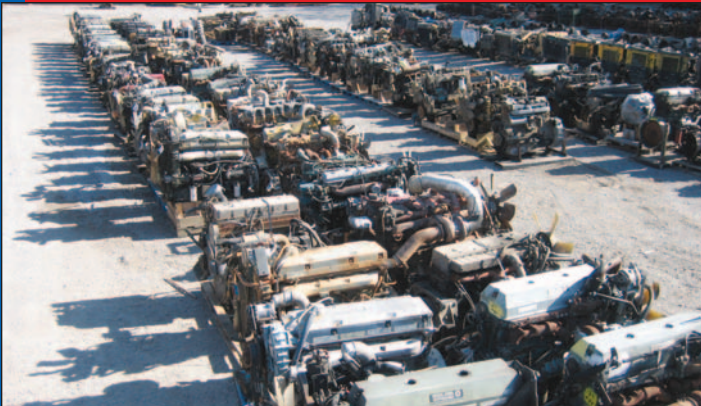
Hundreds of Take Out & Core Diesel Engines

TENNESSEE'S LARGEST TRUCK PARTS AUCTION EVER!