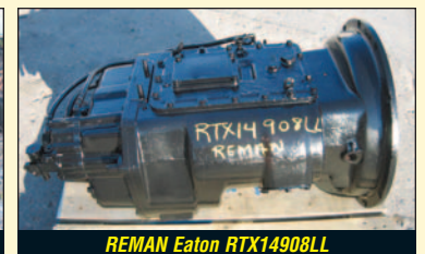
REMAN Eaton RTX1490LL