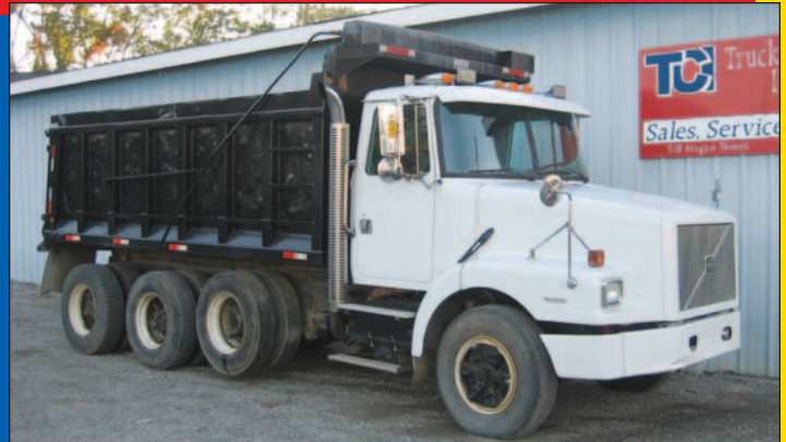
1995 Volvo WG Tri-Axle Dump Truck