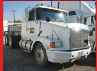
1993 White GMC Tandem Axle Truck Tractor