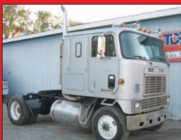
International 9670 Running and Driving