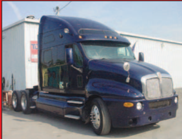
1999 Kenworth T2000 Cummins N14 460+ Running