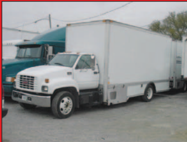
1999 GMC C6500 Multi Temp Refrigerated Truck complete with Onan Generator