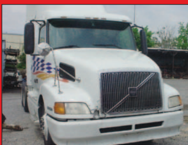
1999 Volvo 660 Truck Tractor Easy Fixer