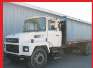
Mack Renault Single Axle Flat Bed Truck 20' Bed