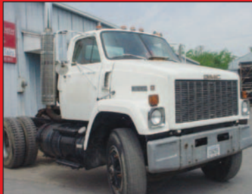
GMC Brigadier Single Axle Truck Cummins Power