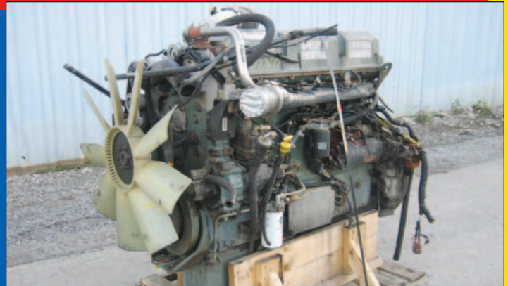
Detroit 14L 500hp 213,000 miles (Low Miles)

TENNESSEE'S LARGEST TRUCK PARTS AUCTION EVER!