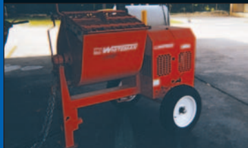
Whitman Mortar Mixer