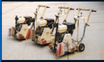
Edco Street Saws