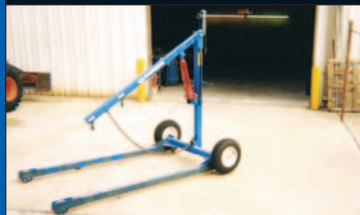
Engine Hoist by Bluebird