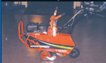
Jacobsen Sod Cutter