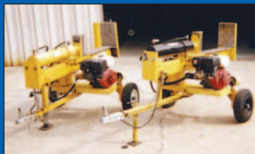
Power Tec Log Splitters