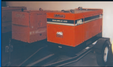
Dualweld 400 270 Amp welder and 8.8 KW generator