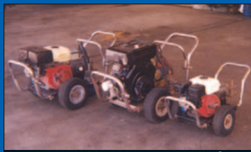
1500, 2000, 3000, and 4000 PSI Pressure Washers