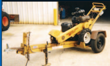
Rayco Mini Work Force Stump Grinder