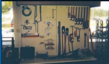
Many Assorted Tools