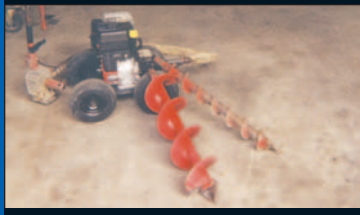
Power Auger with 4, 6, and 8 inch bits