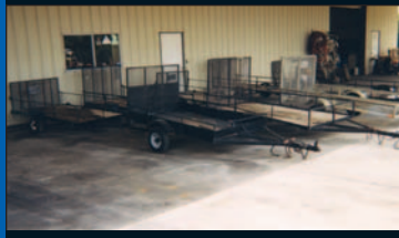
Several Utility Trailers