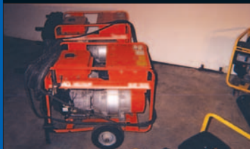
Multiquip GIW-180H Welders