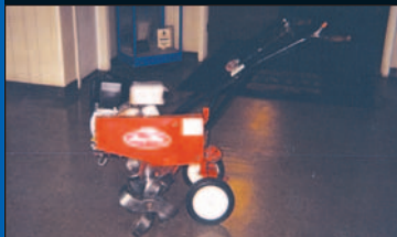
Merry Front Tine Tiller