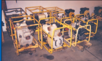
Wicker PT2 and PT3 Pumps