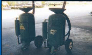
Lindsay 600 Sand Pots