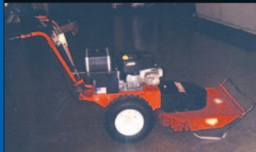
Merry Mac Brush Cutter