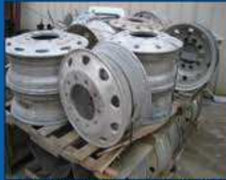
LARGE ASSORTMENT OF ALUMINUM RIMS

WEDNESDAY, MAY 19TH, 9AM 5400 RUTLEDGE PIKE KNOXVILLE, TENNESSEE