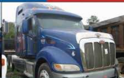
2001 PETERBILT, CAT C-15, 550 HP, #7DB9X31D544404