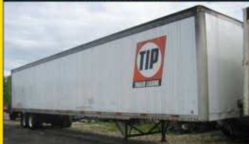
ONE OF DOZENS VAN TRAILERS TO CHOOSE FROM