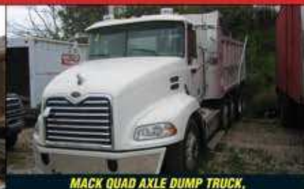
MACK QUAD AXLE DUMP TRUCK, MACK E-7, # AK06Y96N008489