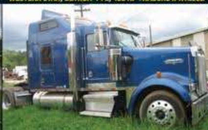
1999 KENWORTH, CAT 3406E, 475 HP