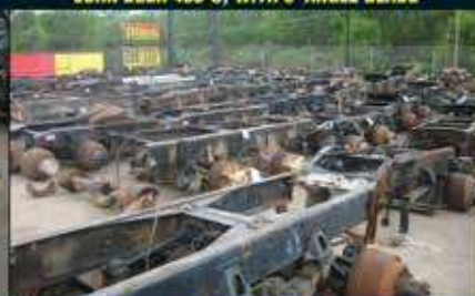
GOOD SELECTION OF TANDEM CUT OFFS