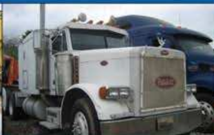
1990 PETERBILT, CAT 3406B, 425 HP #5DB9X3LD285956