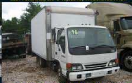
1996 ISUZU 4BD2T, 135 HP # B481K8T7001240