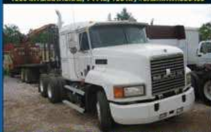
1995 MACK, MACK E-7, 350 HP, # AA13Y5SW049168