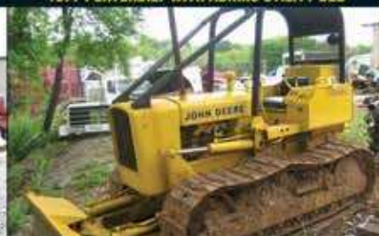
JOHN DEER 450-C, WITH 8' ANGLE BLADE