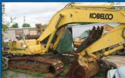
KOBELCO MODEL # SK 330LC

NO RESERVATIONS • NO MINIMUMS • NO BUY BACKS