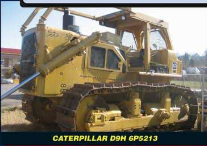
CATERPILLAR D9H 6P5213

5400 Rutledge Pike, Knoxville, Tennessee