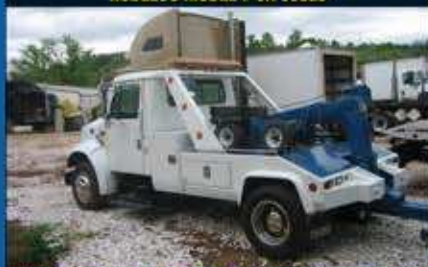
1998 INTERNATIONAL, T444E, 190 HP, #C48MXWH508463