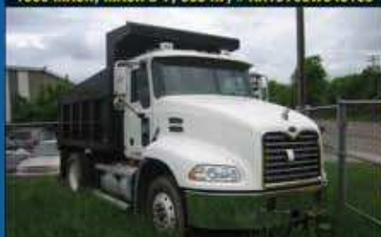
2004 MACK, MACK E-7, 310/330 HP