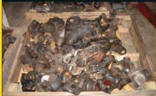
HUGE SELECTION OF ASSORTED PARTS