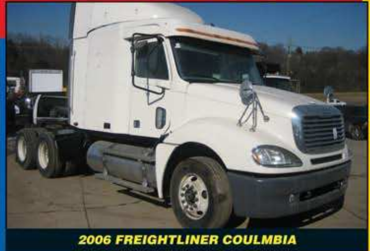
2006 FREIGHTLINER COULMBIA

Too many items to list, NEW ITEMS added daily, please see our web site for details: www.BerryhillAuctioneers.com Register Online and Bid Online LIVE at www.BerryhillAuctioneers.com • Cash Deposit must be made to Bid LIVE Online – Minimum 20% of Bid Register and BID LIVE ONLINE at our Website www.BerryhillAuctioneers.com