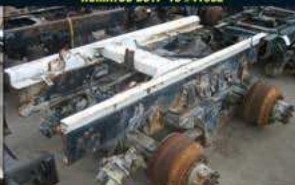
ROCKWELL SSSH 4.33 RT