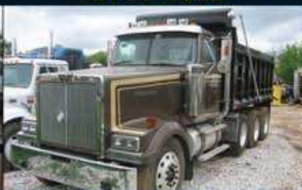
WESTERN STAR, DETROIT 14 L, 435 HP #KABCK94PW12592