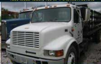
INTERNATIONAL 4700, DT 466E, #1HTSCAALXXH621257