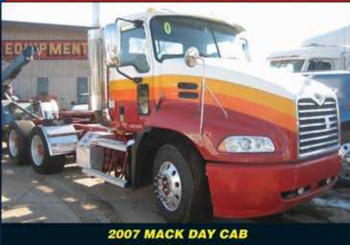
2007 MACK DAY CAB

GOING OUT OF BUSINESS-COMplete LIQUIDATION