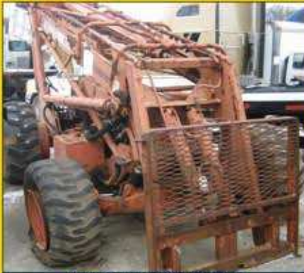
ONE OF MANY LIFTS TO BE SOLD

5400 Rutledge Pike, Knoxville, Tennessee