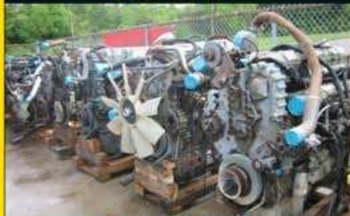
SEVERAL DETROIT SERIES 60