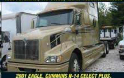
2001 EAGLE, CUMMINS N-14 CELECT PLUS, 400 HP CEAER11C020335