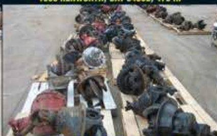
LARGE ASSORTMENT OF REARS