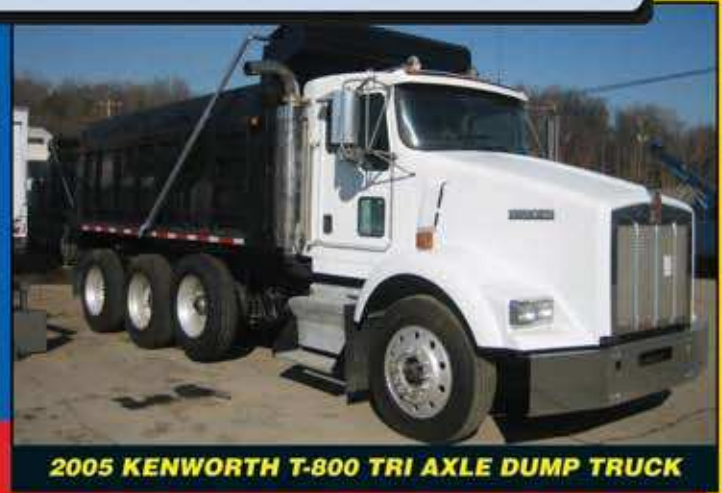
2005 KENWORTH T-800 TRI AXLE DUMP TRUCK

GOING OUT OF BUSINESS-COMplete LIQUIDATION