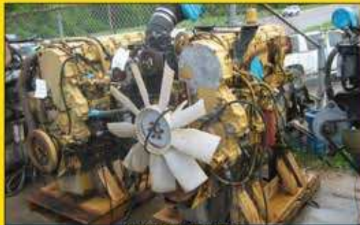
CATERPILLAR 3406 E