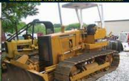
KOMATSU D31P-18 #41892