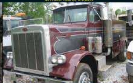
1977 PETERBILT WITH ADKINS UTILITY BED