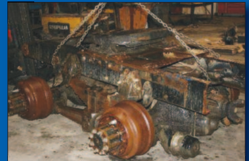
Great selection of Late Model Tandems