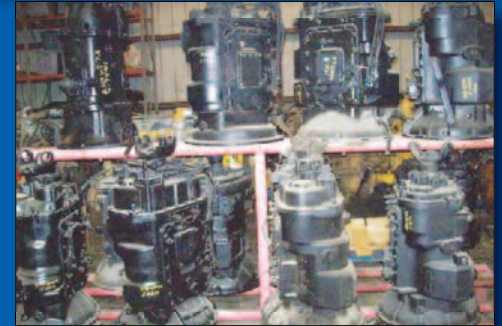
Huge selection of Checked Take Out Transmissions