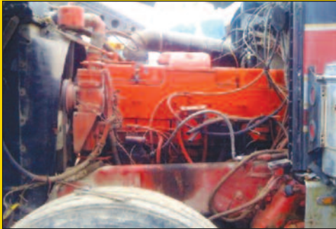
KT450 Take-out of a good running Peterbilt