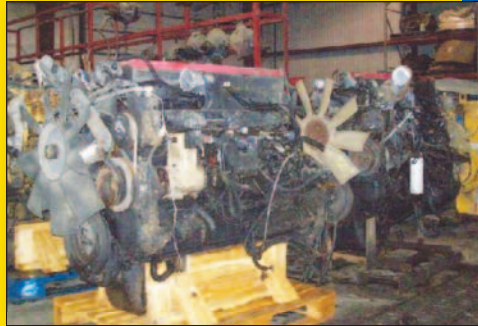
Several Cummins N-14 Red Top Engines