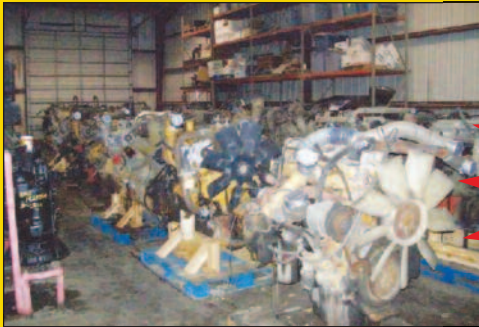
Best selection of Take Out Diesel Engines in the USA!

Mississippi's Largest Truck Parts Company!