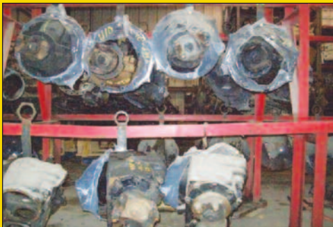
Hundreds for Checked Take Out Differentials